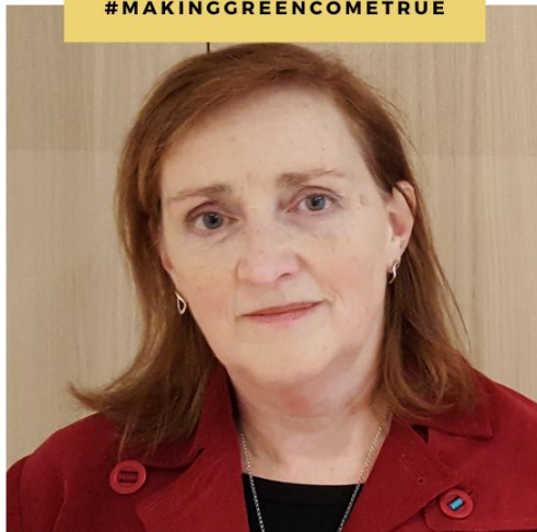
Emma Dent Coad

Emma Dent Coad has been a long-term political activist, socialist, campaigner on inequalities, local Councillor since 2006 and was MP for Kensington June 2017 to December 2019. She says, 'People still shout in the street - Emma, our MP! - which is lovely. I'm in it for the long haul. I'm not going anywhere'.