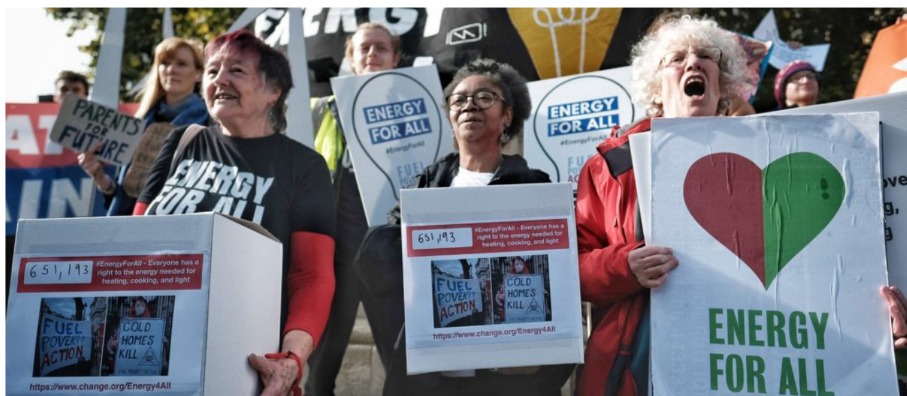
The Energy For All petition was delivered to Downing St last October with over 650,000 signatures, and is still going strong.

The basic principle of a free allocation of energy has been endorsed by many organisations including the TUC, New Economics Foundation, and, in a national poll, by 75% of the population. As organisations and as individuals in responsible positions in UK civil society, we now ask the government and opposition parties to implement this proposal, along with other principles which were laid out in the popular petition or which have been added since then.